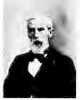
TAPE-ROBBET A- ABBOYS